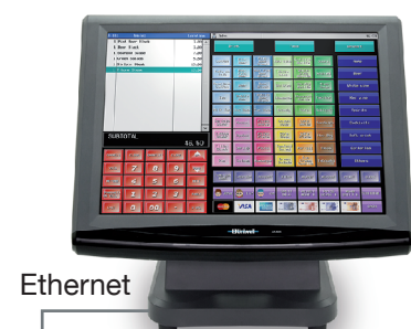
AX-3000 Phoenix Server