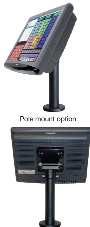
Pole mount option

Specifications subject to change without notice.